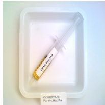
120 mg/ml Ultra Broad Spectrum CBD